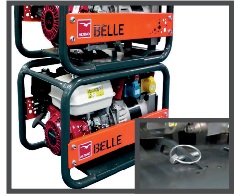
STACKABLE ENGINE PROTECTION FRAME WITH SECURING CLIP