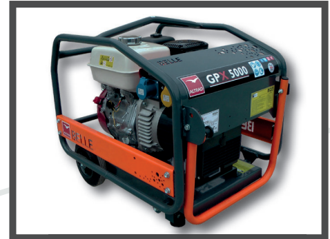
WHEELED GPX 5000 VERSION AVAILABLE