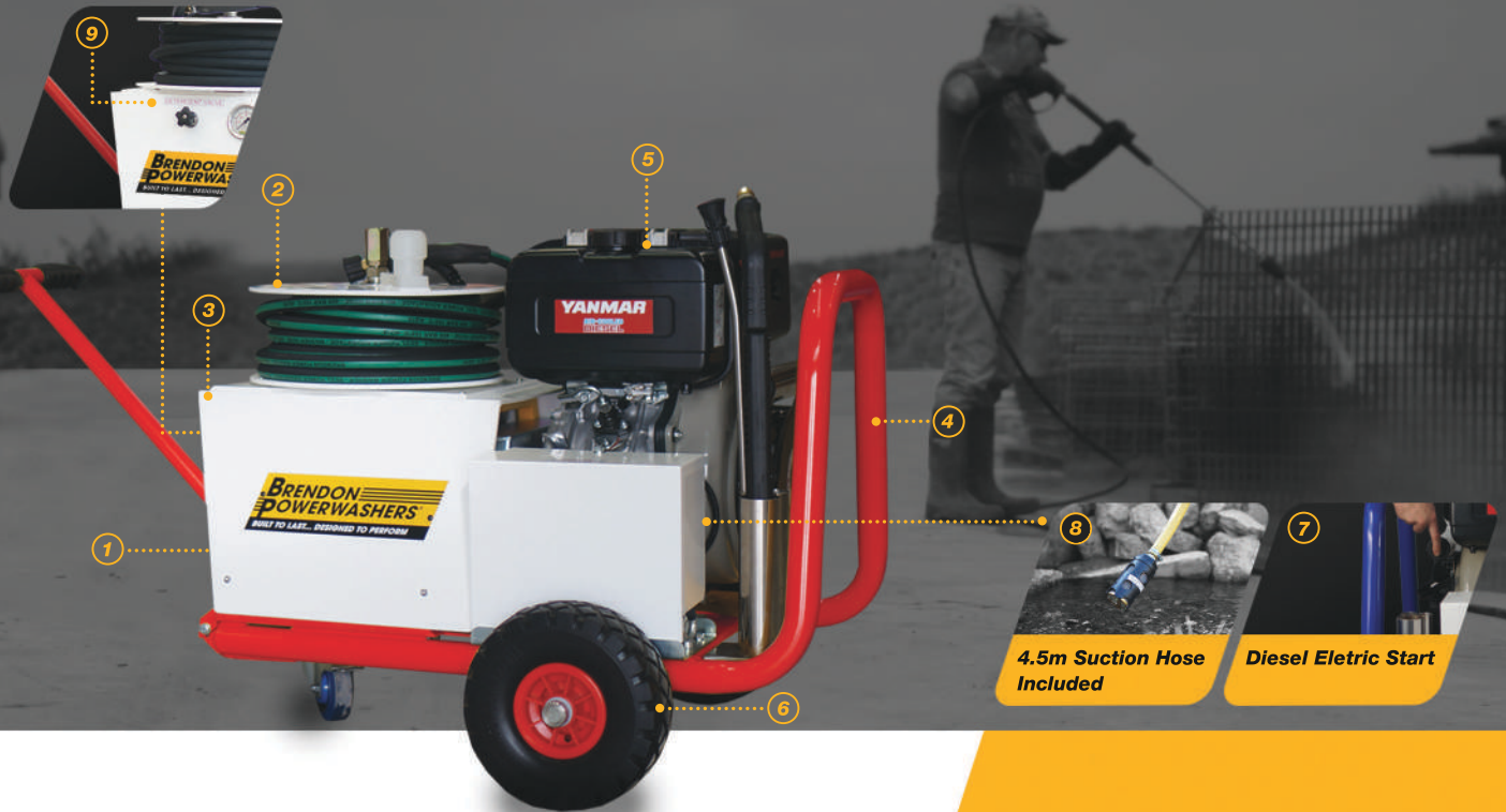
4.5m Suction Hose Included