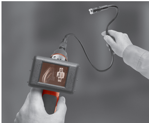
SEE IT: With the SeeSnake micro Inspection Camera you can now easily see objects in hard to reach areas.