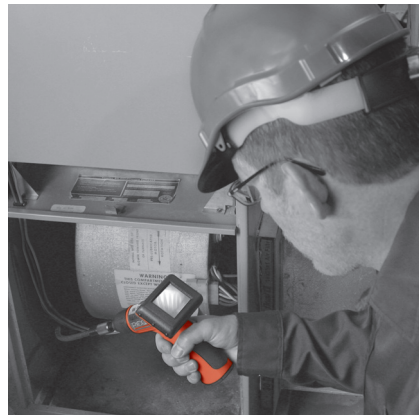
FIND IT: You will easily find and diagnose problems with the 3' flexible cable, color camera, adjustable lighting and 2.4" LCD.