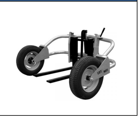
Galvanised Rough Terrain Pallet Truck

We can design and manufacture rough terrain pallet trucks and stackers for most applications, please contact us with your requirements to allow us to provide you with a detailed offer.