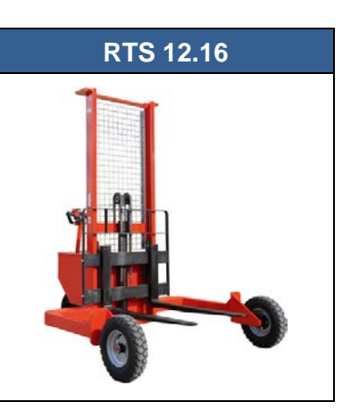
Electric Rough Terrain Straddle Pallet Stacker